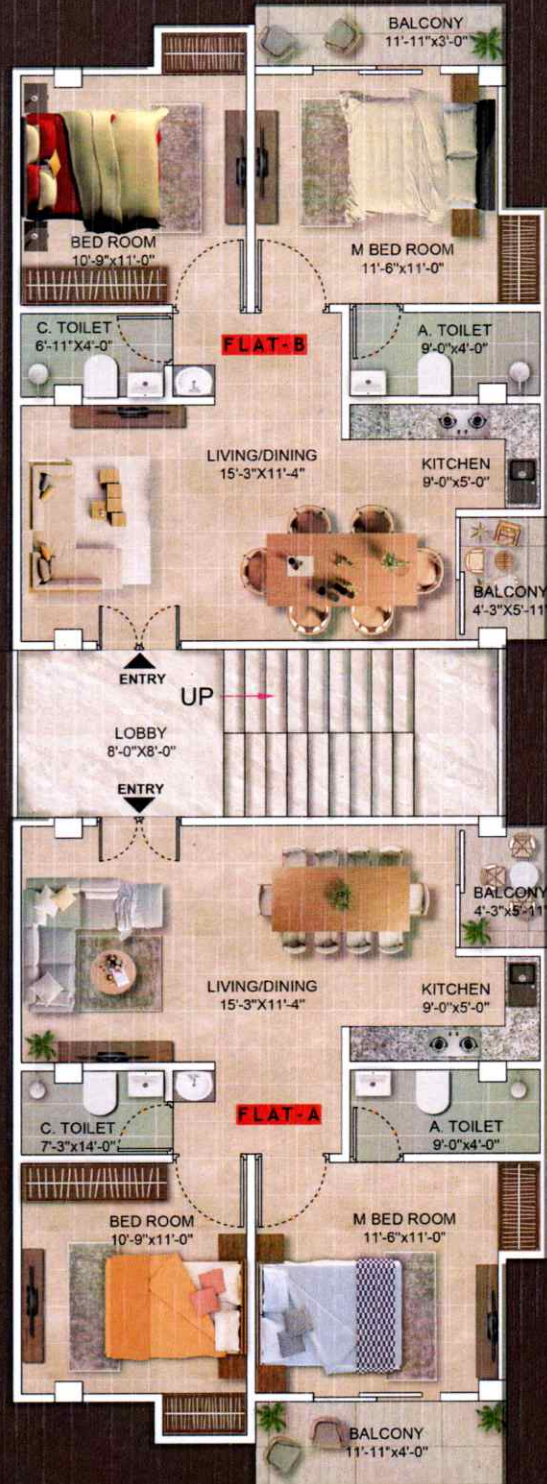
TYPICAL 1ST & 2ND FLOOR PLAN